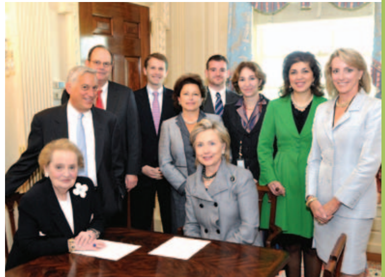
Partners for a New Beginning Chairs meeting with Secretary of State Hillary Clinton to sign the MOU establishing the partnership.

Following the Steering Committee meeting, PNB hosted around 100 business and civil society leaders along with members of the U.S. Department of State to discuss involvement in PNB on a membership level.