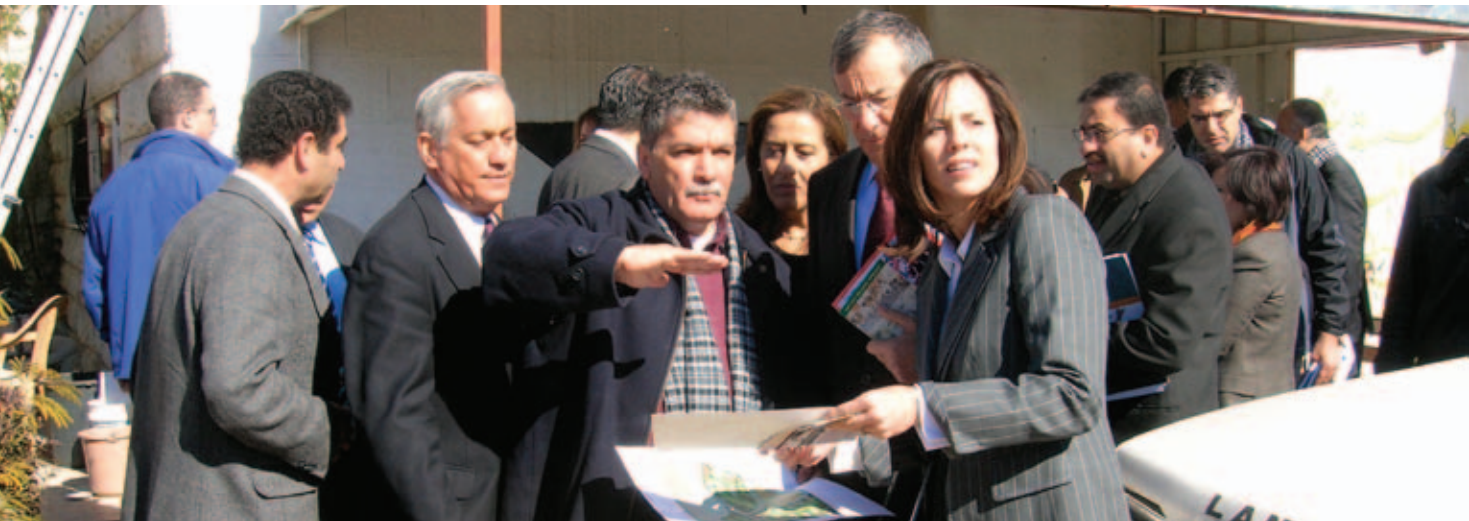
Walter Isaacson, President and CEO of the Aspen Institute and Jean Case, CEO of the Case Foundation and PNB Steering Committee on a tour with the Palestinian leadership of the Ramallah Youth Center.