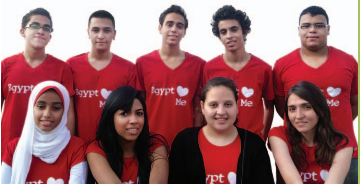
Students submitted ideas on how to rebuild Egypt on the Coca-Cola Facebook page and the winners attended the science camp at the Johns Hopkins University.