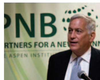
Walter Isaacson, President and CEO of the Aspen Institute at the PNB Summit