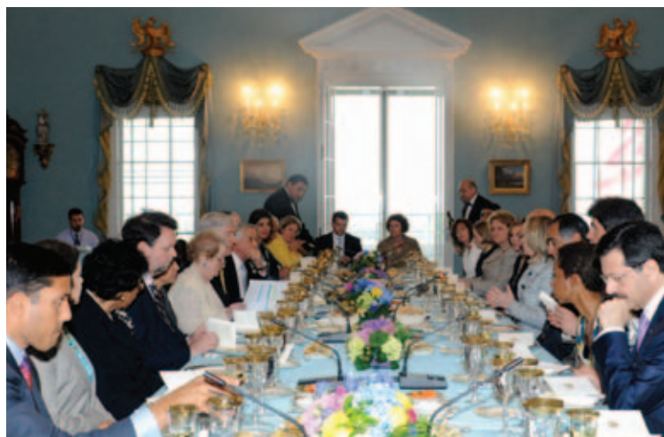
The PNB Secretariat, Steering Committee members and local chapter representatives meeting with Secretary of State Hillary Clinton