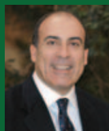
Muhtar Kent PNB Vice Chair