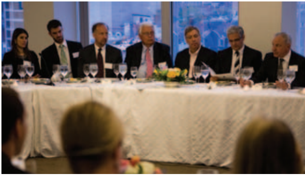
Partners of the PNB-North Africa Partnership for Economic Opportunity with members of the foreign ministries in Algeria, Morocco, and Tunisia on April 15th 2011.