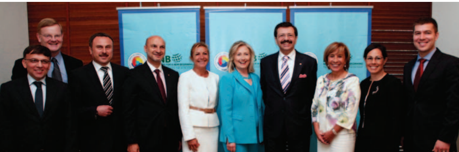
Secretary of State Hillary Clinton with members of the Turkey PNB chapter during her visit in July.