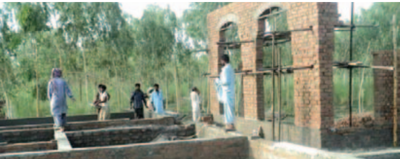
Coca-Cola partnered with local companies and the Citizens Foundation to build schools in flood-affected areas in Pakistan.