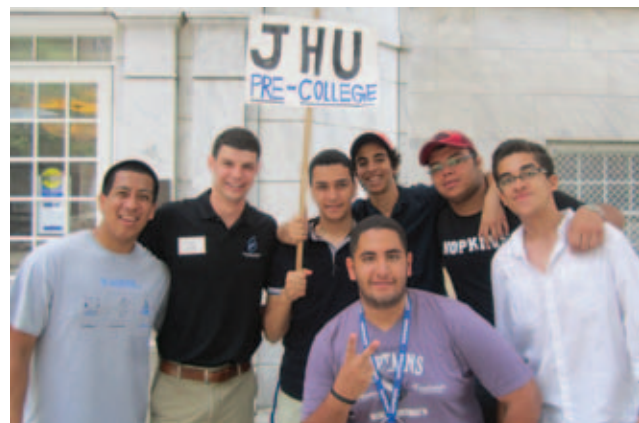
Egyptian exchange students attended a high-level science camp at the Johns Hopkins University in Baltimore. The Coca-Cola Company and the U.S. Embassy in Egypt sponsored their participation.

Egypt Livelihood Program: Building on the Coca-Cola system's existing community program in Egypt – the Egypt Livelihood Program – the Company has committed to work in partnership with the Egypt Food Bank to develop 100 villages by 2020 with an average annual investment from the system of $400,000. In addition to the infrastructure investments already being made in these villages, the Coca-Cola system will partner with the Al Tadamun foundation and the nongovernmental organization Sonna al Hayah to offer micro-loans to women in the villages where Coca-Cola and the Food Bank currently operate. This project may expand through PNB when the local chapter is officially formed.