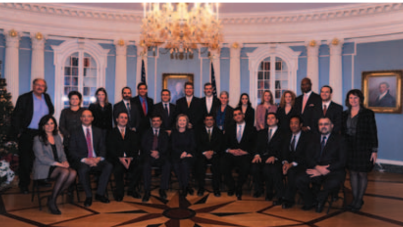
Secretary of State Hillary Clinton hosted the Palestinian IT Initiative (PITI) ceremony.