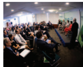
Participants discussed various topics at the PNB summit, including youth employment and women's empowerment.