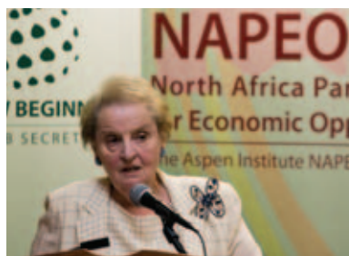
Madeleine Albright, Former U.S. Secretary of State and Chair of the Albright Stonebridge Group at the PNB Summit