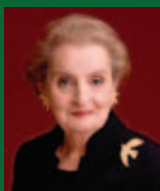
Madeleine Albright PNB Chair