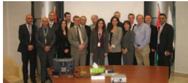
A university partnership delegation visit to the West Bank in March 2011.