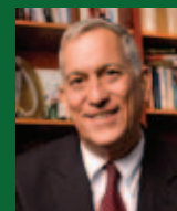
Walter Isaacson PNB Vice Chair

Photo Credits: Madeleine Albright by Timothy Greenfield-Sanders; Walter Isaacson by Patrice Gilbert.