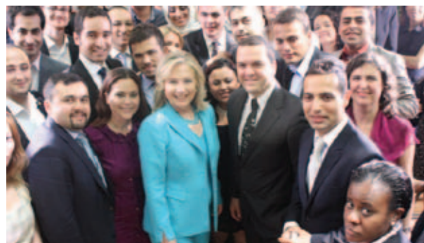
Secretary Clinton at a coffee break with young entrepreneurs, including members of the Turkey PNB chapter.