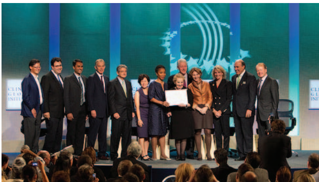
Former U.S. Secretary of State Madeleine Albright, along with Muhtar Kent, Chairman and CEO of The Coca-Cola Company, announce the formation of the Steering Committee at the Clinton Global Initiative (CGI) commitments for Partners for a New Beginning (PNB) in September 2010.