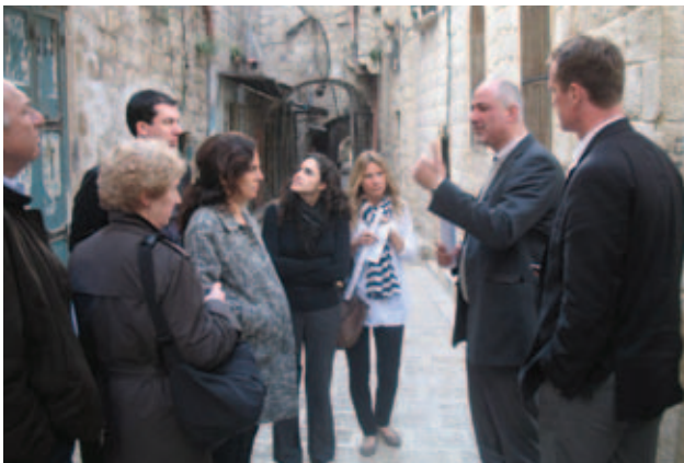
A delegation for university partnerships in Nablus